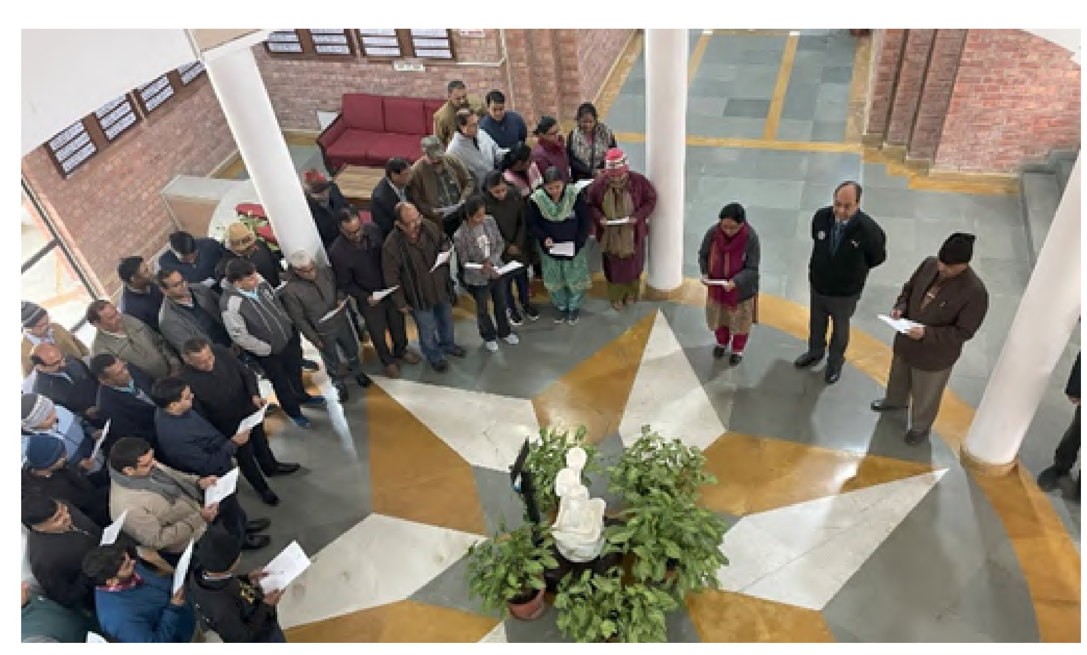
REPUBLIC DAY 2024